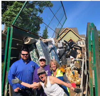
Details: page 7!