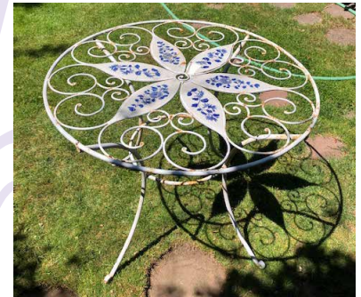
Treasures are always rescued from the dumpster.