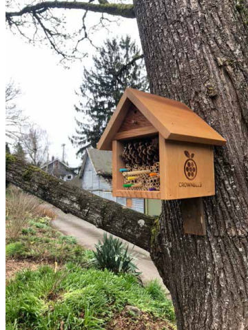
One of the new mason-bee houses.