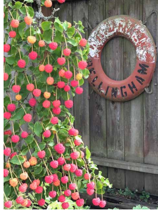
Birds love Himalayan Strawberry Tree fruits in the fall, as shown here in one of York's gardens. In springtime, it flowers as a Dogwood.

Who knew we had a Himalayan Strawberry Tree growing in the neighborhood? Also known as an Evergreen Dogwood, this Cornus capitata beauty will be blooming in the garden where we'll meet Thursday, May 19 , from 5pm to 7pm. We'll talk about our recent Wine and Roses Garden Club activities like the Painted Rock Hunt, our annual plant exchange, and upcoming garden tours in the hood. Bring a chair, beverage, munchies to share, and your great ideas! Newcomers are encouraged to join in. Please email to receive the address of this event: wineandroses@yorkneighborhood.org .