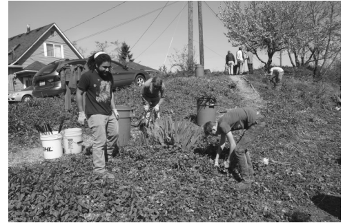
Volunteers pulling weeds at Franklin Park