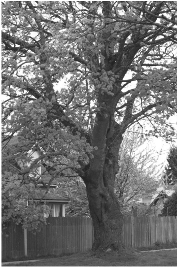
Trees in the York Neighborhood

When Rock Hill Park was first being turned into a park, several volunteers got together and planted a butterfly garden there. You can see it around the playground equipment when you visit the park. Some of the plants there include yarrow, lilac, day lilies, sage, and beauty berry. These