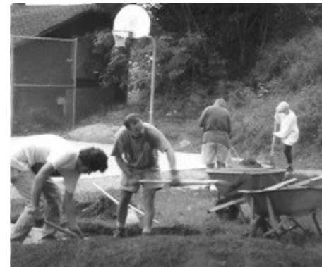
Building the Rock Hill Park basketball court circa 1990