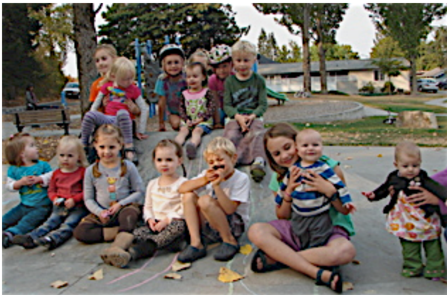
York children pose for the annual photo at the picnic, 2012.

It's fun for all at the annual York Neighborhood Picnic. A tradition is to snap a photo of our neighborhood children, so be sure to show up by 4 o'clock sharp, Sun., Sept. 21, to get in the picture!